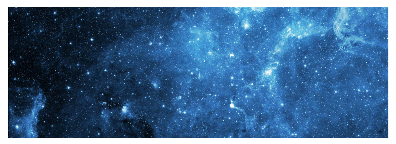
Figure 2: Patients treated with adeno-associated virus (AAV)-delivered gene therapy for choroideremia reported being able to see the stars at night<sup>10</sup>.

With the development of new imaging technologies comes a need for sophisticated methods of data analysis to comprehend the vast data generated from these images. This paradigm is analogous to that of astronomy, which through advanced telescopes generated astronomical amounts of data requiring computational analysis. We now have biological quantities of data. A collaboration between DeepMind and Moorfields Eye Hospital recently published results showing that DeepMind's neural network-based artificial intelligence was able to make expert-level diagnoses on a large bank of OCT scans comprising a wide range of pathologies<sup>9</sup>. Artificial intelligence already has protean applications in common use such as autopilots in aviation or Google Maps.