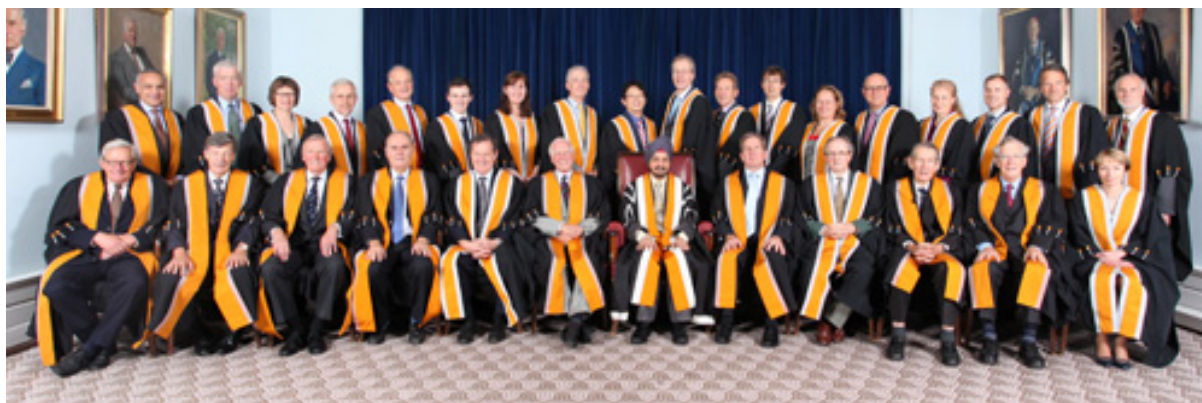
Council Members and Honorary Fellows at the Admission Ceremony September 2011