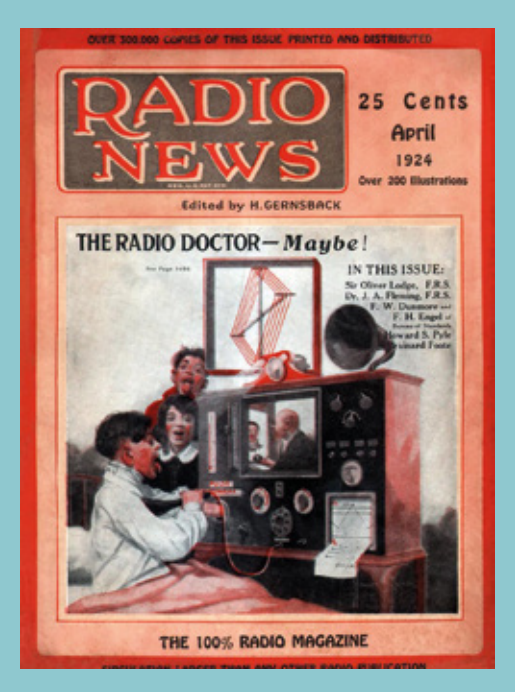
Figure 1. The April 1924 issue of Radio News Magazine.<sup>20</sup>

William Einthoven (1860-1927) is credited with the generation of the prefix "tele" in a medical context in his article in 1906 reporting on the use of a galvanometer with telephone technology to transmit heart sounds 0.9 miles, termed the "telecardiogram"<sup>2</sup>. The telemedicine as we know it today was first circulated in the early 1920s with the advent of radio communications enabling two-way communications between doctor and patient ( Figure 1 ). Relevant to the national health service (NHS) of today, telemedicine is most applicable in the form of the cost-savings model or access-to-market model, whereby cost-effective care can be delivered, within the confines of limited resources whilst defying the constraints of a reliance on health seeking behaviour.<sup>3</sup>